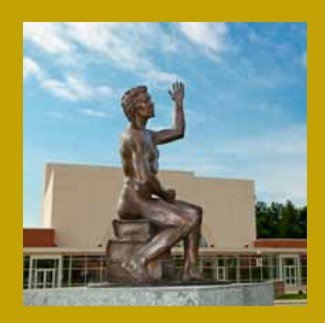
The mind is not a vessel to be filled, but a fire to be ignited.