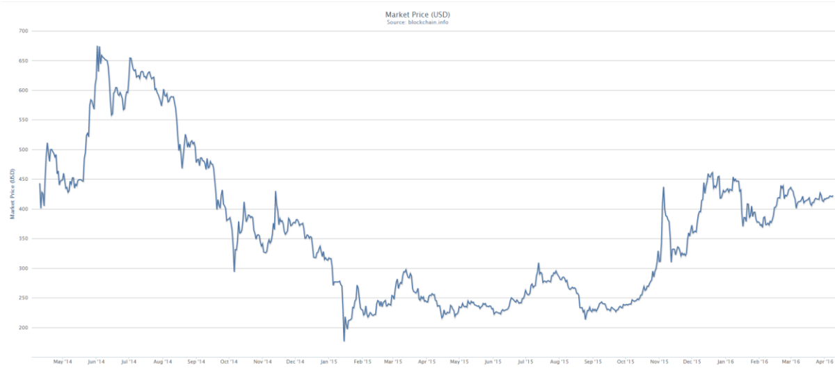
Figure 1: This graph shows the value of a single Bitcoin in relation to its value in U.S. Dollars from April 2014 to March 2016 (Market Price, 2016).

hasn't gained as much trust from the public.